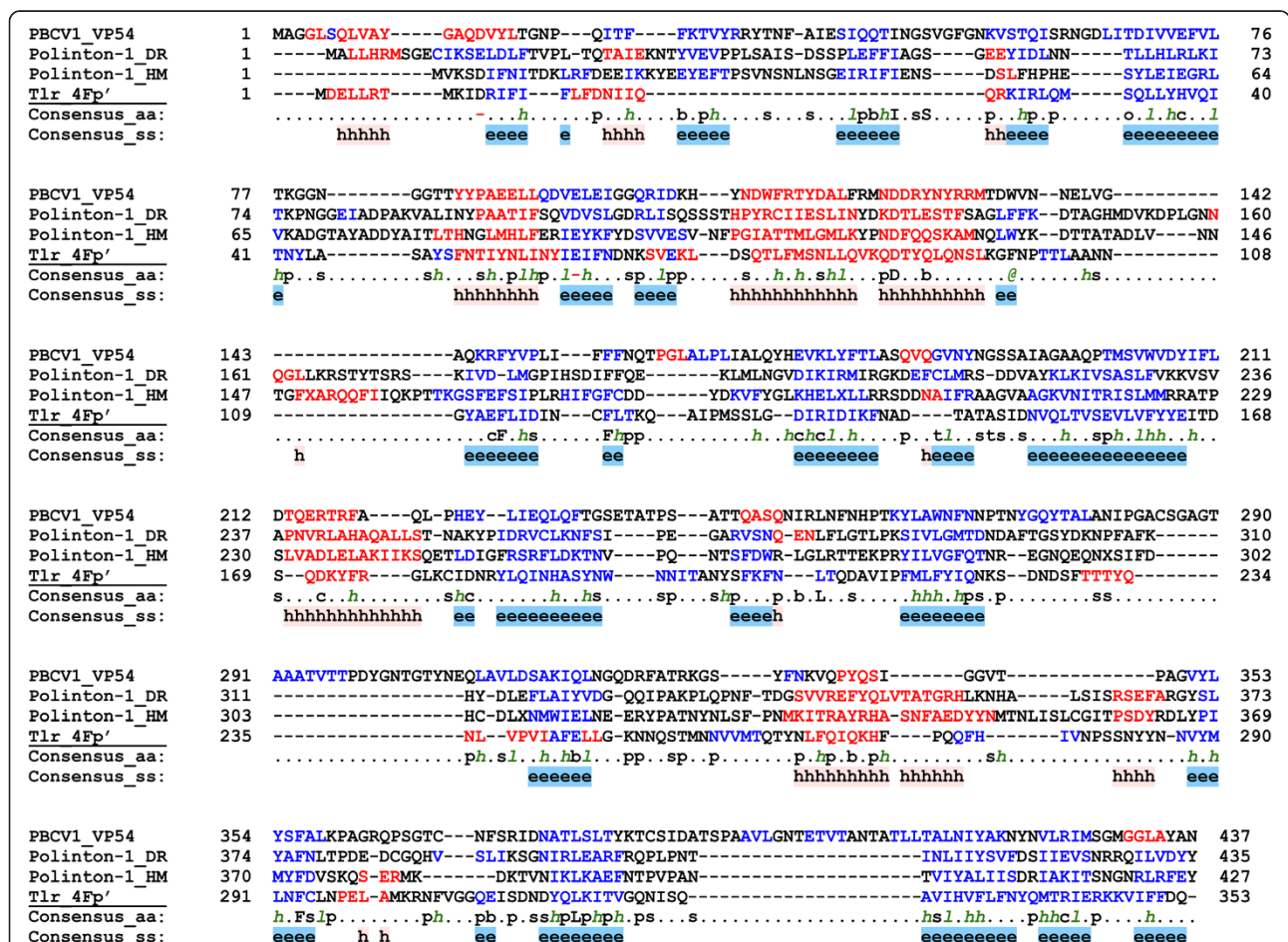
Figure 1 Multiple sequence alignment of the major capsid protein VP54 of PBCV-1 with the PY proteins of Polinton 1 from Danio rerio (DR), Polinton 1 from Hydra magnipapillata (HM), and protein 4Fp' from Tlr element. The last two lines in each block show consensus amino acid sequence (Consensus_aa) and consensus predicted secondary structures (Consensus_ss). The protein sequences are colored according to predicted secondary structures (red: alpha-helix, blue: beta-strand). Consensus predicted secondary structure symbols: alpha-helix: h; beta-strand: e. Consensus amino acid symbols are: conserved amino acids are in uppercase letters; aliphatic (I, V, L): l; aromatic (Y, H, W, F): @; hydrophobic (W, F, Y, M, L, I, V, A, C, T, H): h; alcohol (S, T): o; polar residues (D, E, H, K, N, Q, R, S, T): p; tiny (A, G, C, S): t; small (A, G, C, S, V, N, D, T, P): s; bulky residues (E, F, I, K, L, M, Q, R, W, Y): b; positively charged (K, R, H): +; negatively charged (D, E): -; charged (D, E, K, R, H): c.

We next assessed the conservation of the Polinton MCP-coding genes and found that 46 of the 72 Polintons in the analyzed representative set encoded full-length MCPs (Additional file 1: Table S1), whereas in 13 other polintons the MCP-coding genes were split. Thus, more than 80% of the Polintons contain recognizable intact or fragmented MCP genes. This high conservation of the MCP proteins mirrors the conservation of the FtsK-like ATPase and cysteine protease (PRO), the two other viral-like proteins encoded by Polintons. The Polinton ATPase belongs to the family of genome-packaging ATPases of viruses with DJR MCPs [15,16], whereas PRO is homologous to the virion maturation protease encoded by adenoviruses, virophages and many Nucleocytoplasmic Large DNA Viruses (NCLDV) of